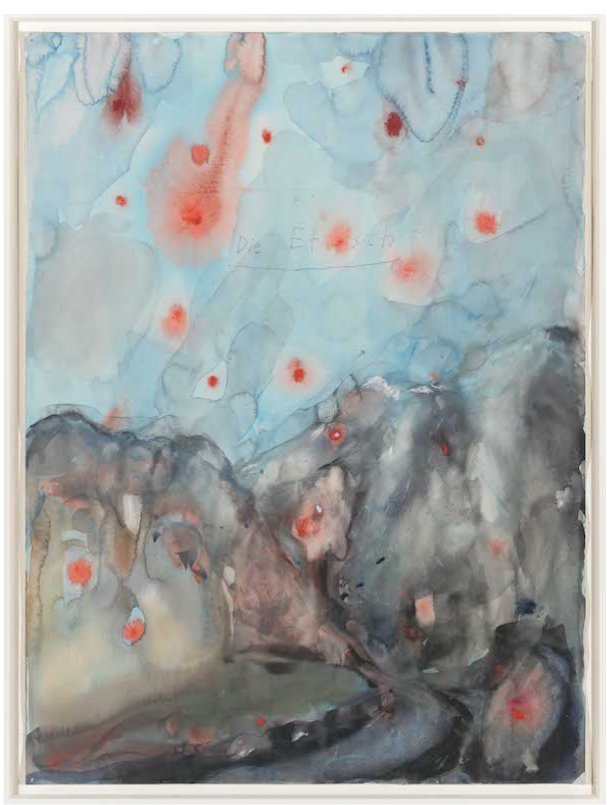
Anselm Kiefer: Early Works, Ashmolean Museum, Oxford, 14 Feb-15 June 2025. Anselm Kiefer (b. 1945) Die Etsch (The Adige), early-1970s Watercolour, gouache and ink on paper, 56 x 41 cm Hall Collection. Courtesy of the Hall Art Foundation. © Anselm Kiefer.