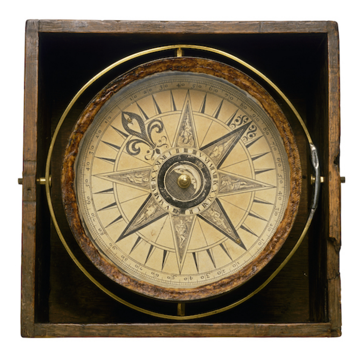
Pirates - National Maritime Museum. Compass, brass, iron, wood and other materials, by Jonathan Eade, London, about 1750