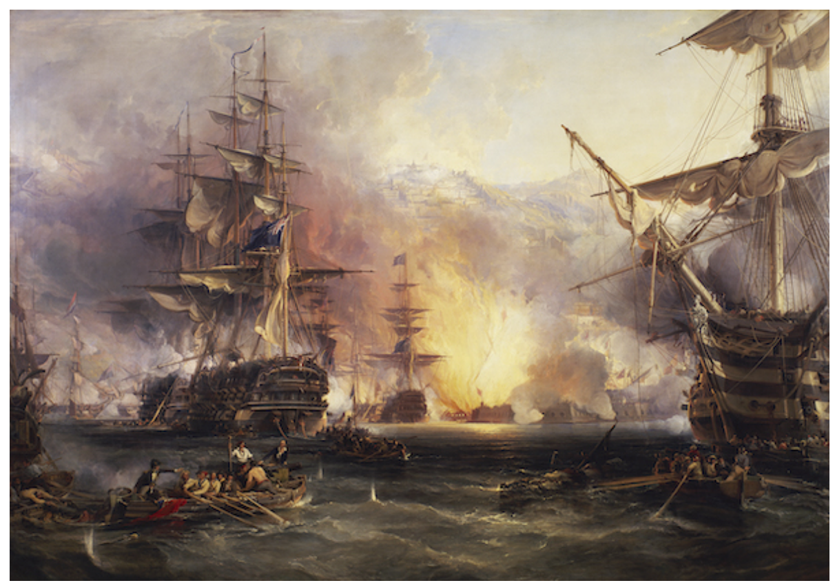
Pirates - National Maritime Museum. The Bombardment of Algiers, 27 August 1816 oil on canvas, by George Chambers, 1836

Also: Welsh Culture Minister refutes claim of 'crisis' in the country's arts sector, Arts Professional (£)