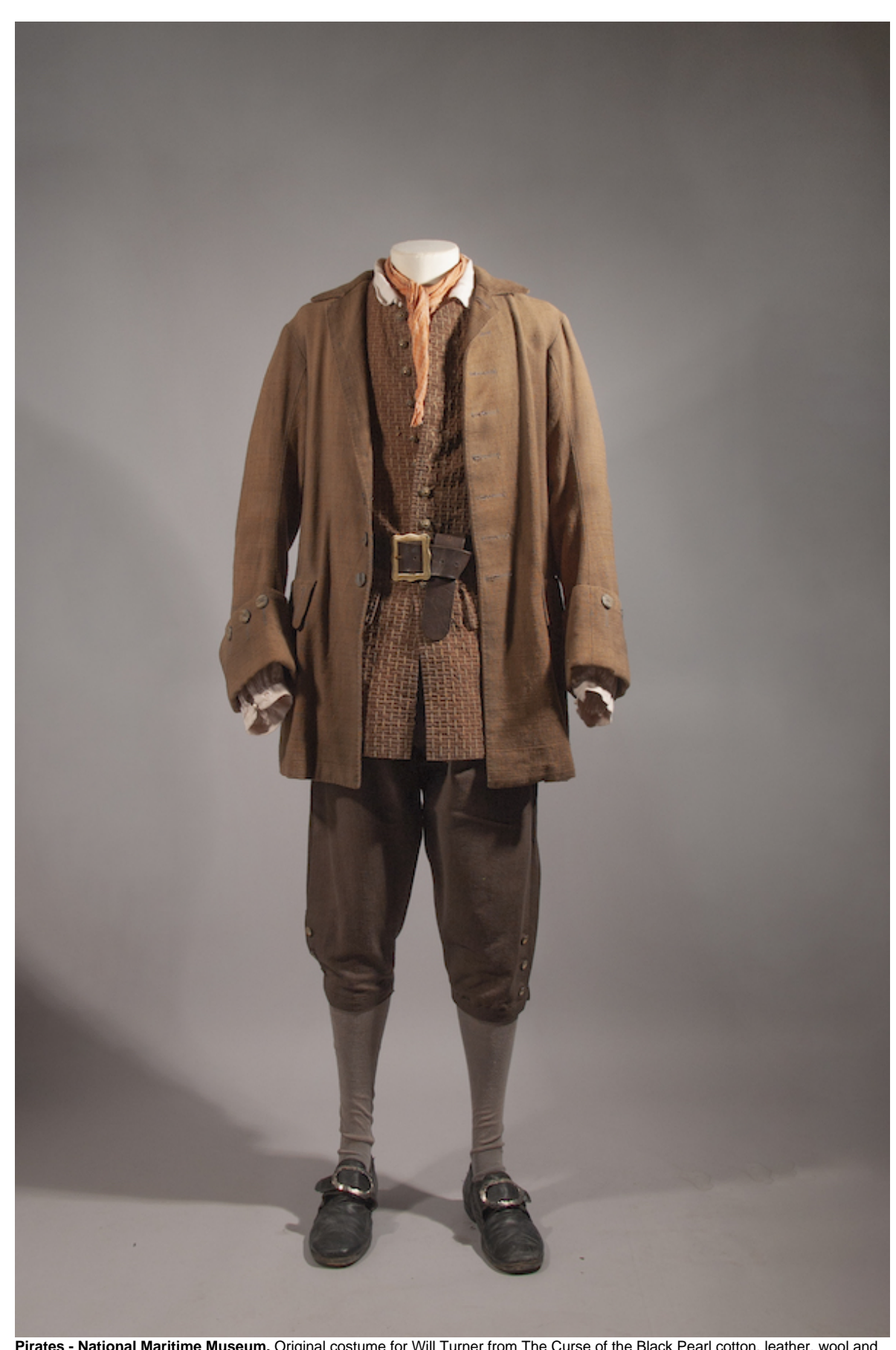
Pirates - National Maritime Museum. Original costume for Will Turner from The Curse of the Black Pearl cotton, leather, wool and other materials, designed by Penny Rose, about 2002 © Penny Rose / CosProp