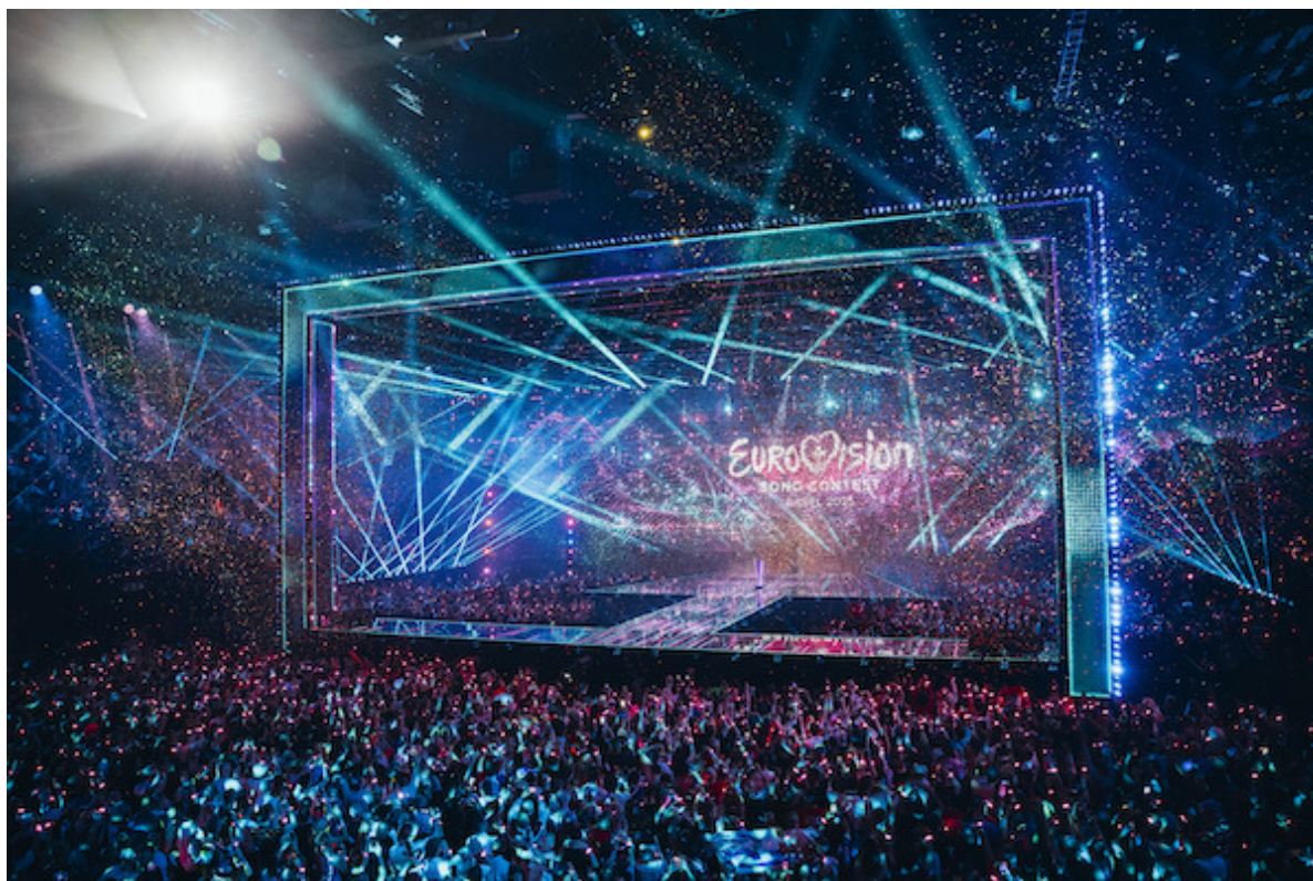
'Setting the Stage: 70 Years of the Eurovision Song Contest' at the National Science and Media Museum.

Trent Park House in Enfield will open as a museum telling the story of 'Secret Listeners' – intelligence operators hidden in the basement – whose eavesdropping of senior German prisoners led to some of the most important intelligence breakthroughs of WWII. Trent Park was originally part of King George III's estate and the first house was constructed in the 1780s. In the 1890s the house was rebuilt in the Victorian style before an extensive refurbishment by Sir Philip Sassoon in the 1920s, transforming it into a luxury weekend retreat for hosting his fashionable and famous guests at elegant parties. Following the restoration, visitors will journey through restored and furnished rooms that were the backdrop to Sir Philip Sassoon's socialite and political world, where he hosted some of the most influential statesmen, journalists, royalty and politicians in the 1930s. Trent Park , M+H Advisor , Time Out