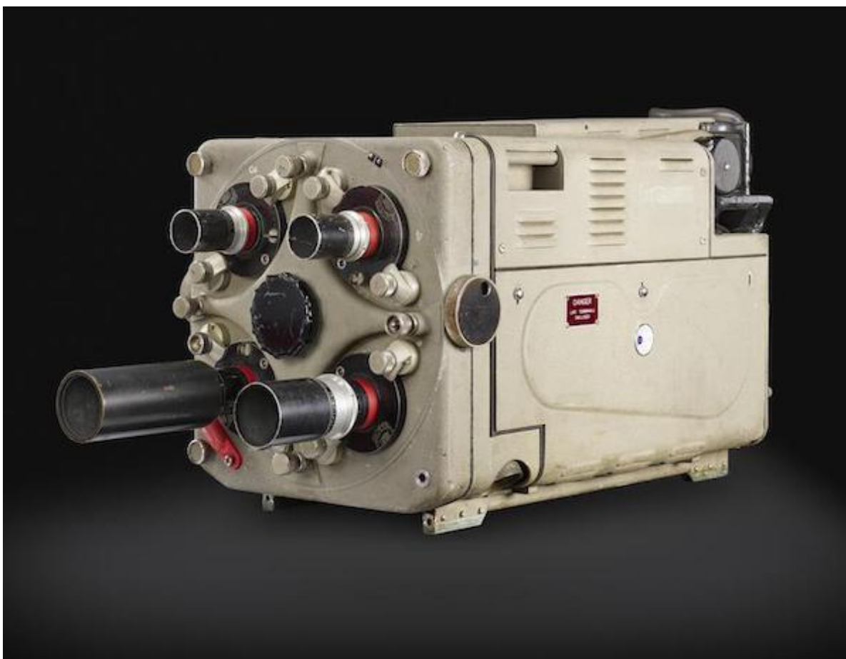
Marconi Mk III Camera Head that will be going on display in the exhibition 'Setting the Stage: 70 Years of the Eurovision Song Contest' at the National Science and Media Museum.

Also: From messages to conversations: AI agents are changing how we find culture, Arts Journal